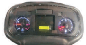
User friendly Instrument Panel