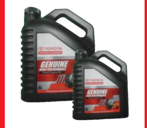
Genuine Oils & Lubes