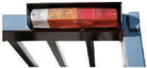
Protected Tail Lamp