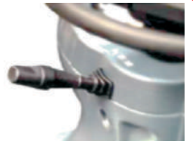
Return to Neutral Function