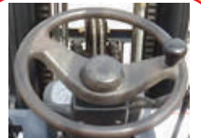
Small Steering Wheel