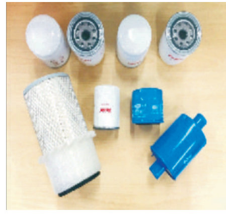
Preventive Maintenance (Super Saver Kit)