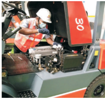
Service by Toyota Qualified Engineers